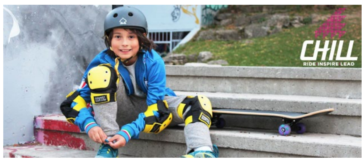
ADWAS partners with the Chill Foundation to allow children that have experienced domestic violence, the opportunity to learn board sports and put those skills that they learn on the slopes, water and skate park to use, overcoming challenges I their daily lives.

Looking for interpreter to volunteer their time to give to a great cause